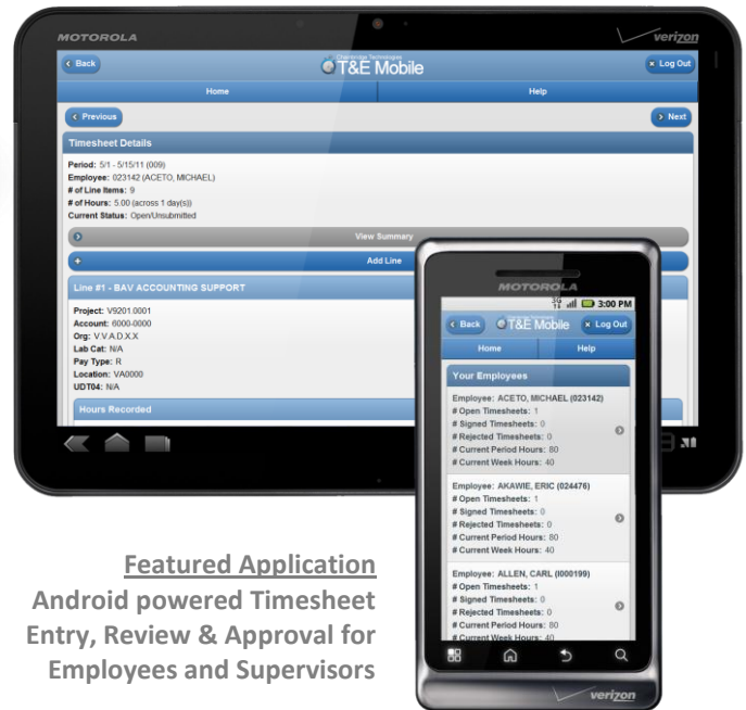
Featured Application Android powered Timesheet Entry, Review & Approval for Employees and Supervisors

Chainbridge Technologies CP mobile platform extends CP x powered applications to your wireless Android, Apple, BlackBerry and Windows powered devices.